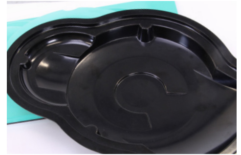
The cured mould has an excellent surface finish and is temperature stable up to 135°C.