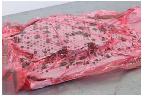
Once laminated, the part is vacuum bagged and cured in an oven at 65°C for its initial cure.