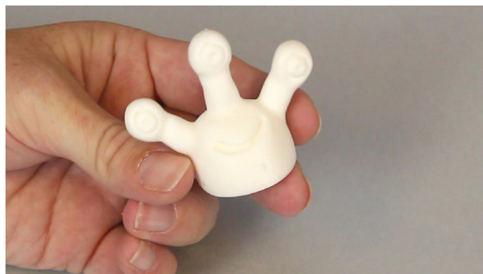
Image 2. Base Colour of Xencast P2 Fast Cast Resin.

(From left to right - with 2 drops, 5 drops, 10 drops, 20 drops and 40 drops).