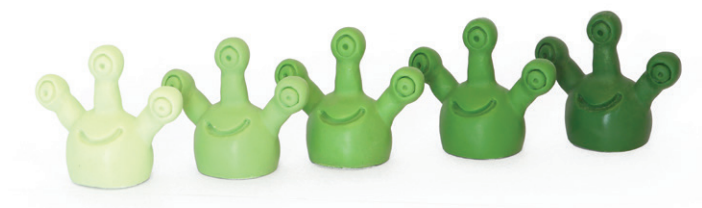
Image 1. Aliens cast using the Xencast Resin Casting Starter Kit and Green Translucent Tinting Pigment.

The following images were taken from the alien army casting project using the Xencast Resin Casting Starter Kit. In images 1 and 3 Translucent Tinting Pigments were added to the Xencast P2 Resin.