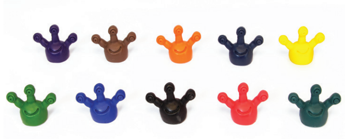
Image 3. Aliens pigmented with 20 drops each of Translucent Tinting Pigment - 10 pack from Easy Composites.